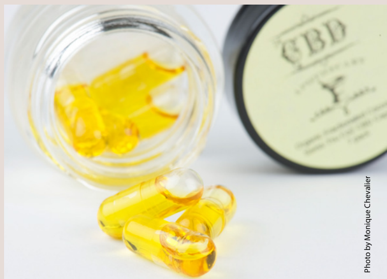
Medicinal marijuana is, well, medicine. As such, it can come in capsules to enhance time-released pain relief.

He medicates to alleviate the extreme spasticity and stiffness (tone) in his legs and to quell the accompanying pain. Cannabis helps a lot but not enough, so during the day, for spasms