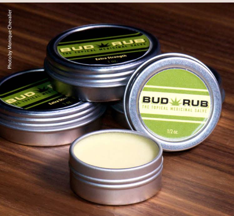
Proponents say that Bud Rub, a topical salve, relieves aches and pain with no psychotropic side effects.

allows me to eat and achieve restful sleep. My preferred delivery method is vaporization.”