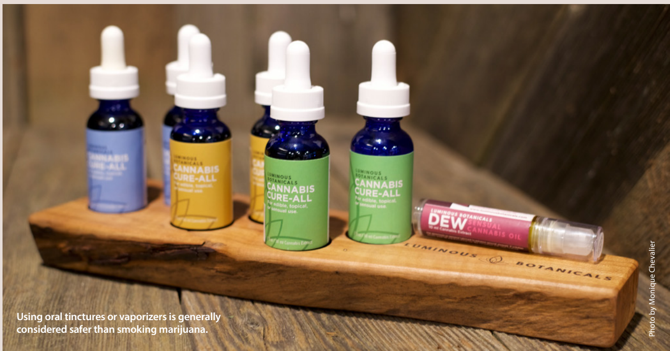
Using oral tinctures or vaporizers is generally considered safer than smoking marijuana.